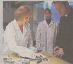
A scene from Waking the Dead

■ Silent Witness: Police investigating the murder of a gay man find that DNA in his killer's skin cells contains evidence of a rare Jewish genetic disease. A married Jew whose DNA matches is arrested but it later emerges the killer was his estranged brother, exiled from the family because of his sexuality.